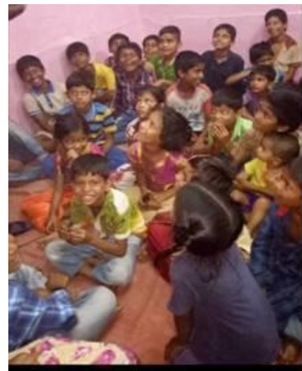
142 kids attended from 6 villages participated, Children Program at Andugulapalle village, Medak dist