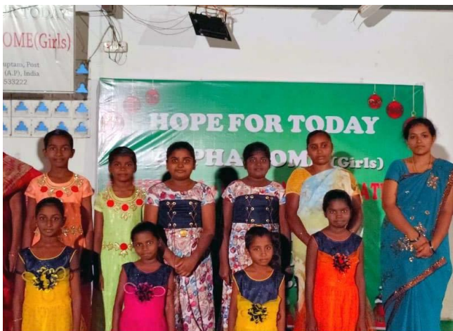
Girls Home at Rajahmundry, AP- Girls