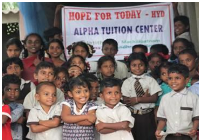
Alpha Tuition Center - Malakayalanka, AP