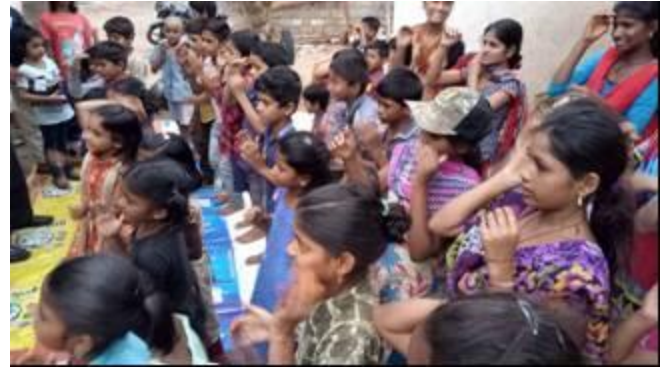
On May 16,17 &18 th at Bowenpally slum 59 kids attended