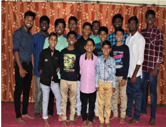
Boys Home at Boddupal, Hyderabad