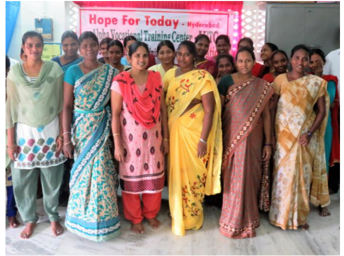
AVTC Center Rajupeta, Machilipatnam - AP