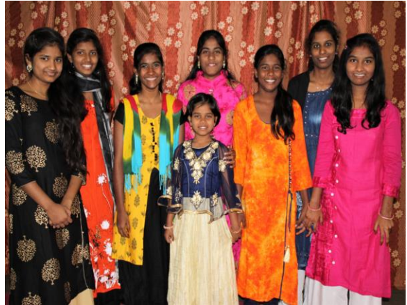
Girls Home at Boddupal, Hyderabad