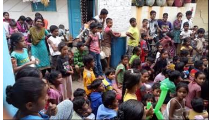
15th May, 2018 at Moulali Slum area 37 slum kids enjoyed fruits story, games, puppet, and lot.