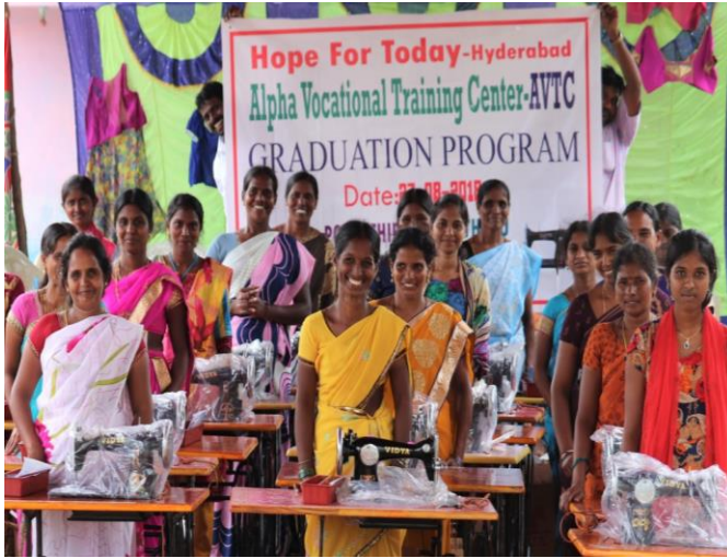
AVTC Center, Polatithippa- Machilipatnam.AP