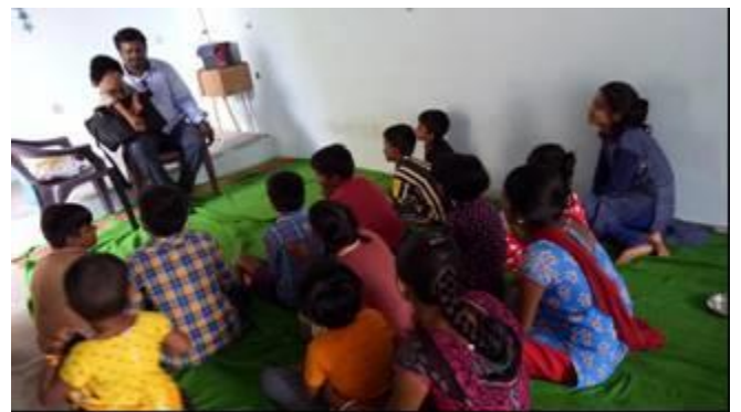
May 17th 18th 19th, 2018, at Nalgonda. Dist. Tribal thanda. 59 kids attended children program at kadalbaithanda, nalgonda dist.