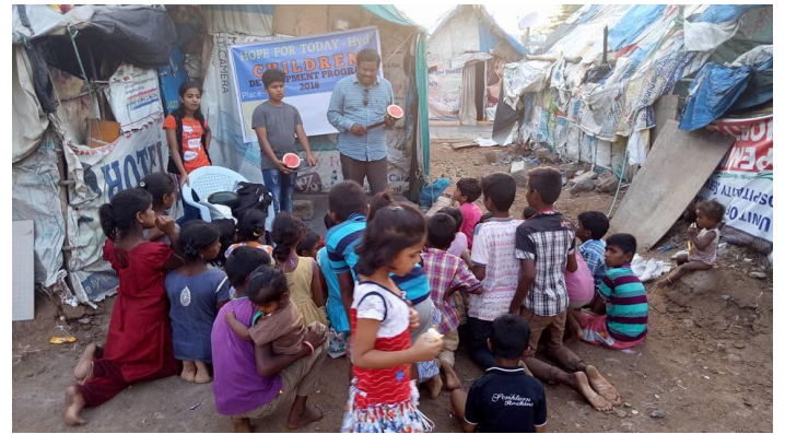
May 15th, 16th, 17th, 2018- Summer special school program at malkapur village, 20 kids enjoyed the story time, memory words, puppets show, games, snacks, gifts, and lunch.