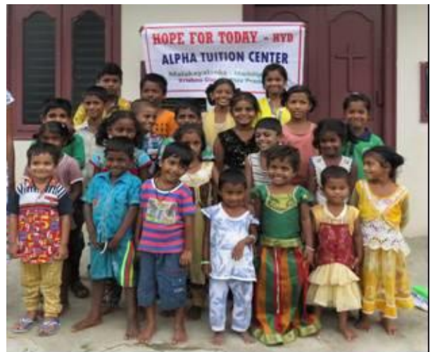
Alpha Tuition Center Polatithippa, AP